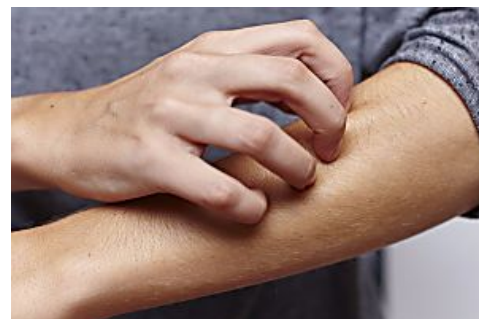
Psoriatic Arthritis Symptoms: What You Should Know YAHOO SEARCH

Argos release Christmas ad showing Yetis keeping cool in the capital