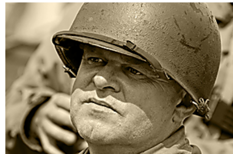
The amazing VA benefits not enough vets are claiming LENDINGTREE

The date the Christmas window will be displayed until is not known, but will likely be taken down soon after the Yuletide festivities are over.