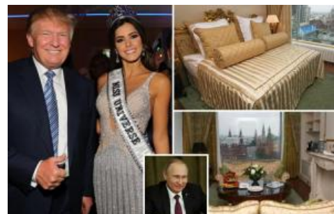
FALSE LEAK Putin pours cold water on claims Russia has 'compromising' info that Donald Trump had 'perverted...